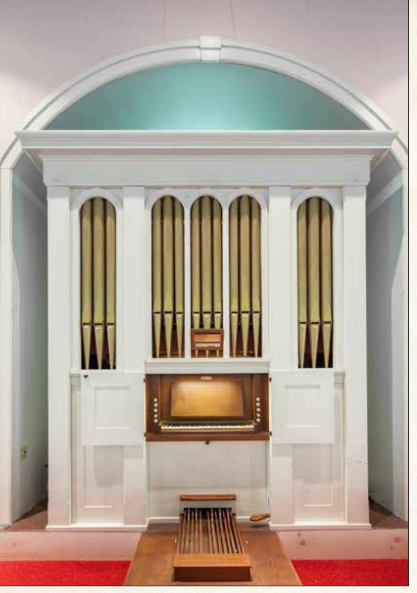
FIRST CONGREGATIONAL CHURCH ~ MONTAGUE WM. A. JOHNSON, OPUS 54 (1856)

Pan bus lines is in Springfield; and, the bus and train stations are about a half-mile from the convention hotel. As such, Springfield is easily accessible nationally and internationally, from Hartford, Boston and New York, Albany and Montreal.