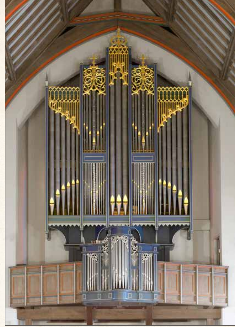
MOUNT HOLYOKE COLLEGE ~ SOUTH HADLEY C.B. FISK, OPUS 84 (1985)

CONVENTION REGISTRATION WILL OPEN ON SUNDAY, WITH free time in the city and dinner on your own. Christ Church Episcopal Cathedral will offer Evensong before the dinner